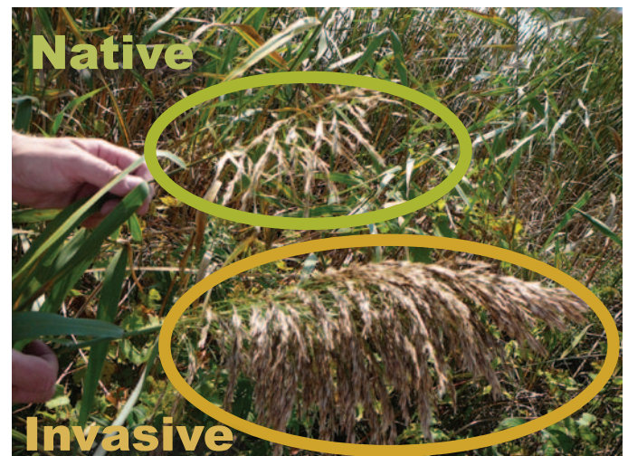
Figure 4: A native Phragmites seedhead (top) and an invasive Phragmites seedhead (bottom). Note that the native Phragmites seedhead is smaller and sparser compared to that of the invasive Phragmites .

Invasive Phragmites stems are generally tan or beige in colour with blue-green leaves and large, dense seedheads, in contrast to the reddish-brown stems, yellow-green leaves, and smaller, sparser seedheads of native Phragmites (Figure 2, 3, and 4). Cross-breeding between invasive and native Phragmites plants has not been confirmed in the field, but has been produced in laboratory studies. Where the plant is found in certain environmental conditions such as those that occur along sandy coastal shorelines and deep water systems, the morphological differences described above are not definitive. If it is not clear whether a Phragmites plant is invasive or native, it is recommended that a Phragmites expert be consulted.