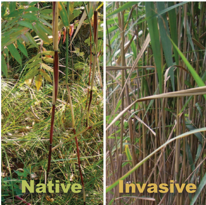
Figure 2: A native Phragmites stem (left) and an invasive Phragmites stem (right). Note the reddish brown native stem on the left, and the tan/beige invasive stem on the right.

Native stand photo courtesy of Erin Sanders, MNR. Invasive stand photo courtesy of Janice Gilbert, MNR.