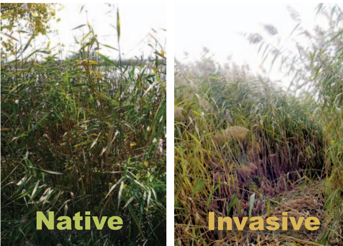
Figure 1: A native Phragmites stand (left) and an invasive Phragmites stand (right). Note the varied vegetation and lower density of native Phragmites stalks on the left and the taller, higher density invasive Phragmites stalks on the right.

Invasive Phragmites reproduces by dispersing seeds, by roots via rhizomes, or by stolon fragments. Dispersal can be natural through water, air, or animal movement, as well as through human actions and equipment such as horticultural trade, boats, trailers, or ATVs. Invasive Phragmites rhizomes can grow horizontally several metres per year and this is the most common method of reproduction. Vertical plant growth can reach 4 cm per day and plants can produce thousands of seeds annually.