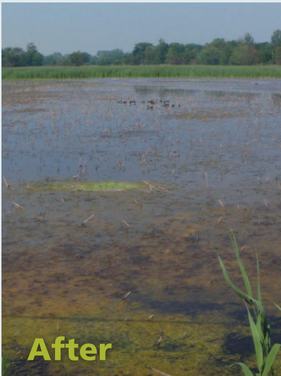
Figure 5: A study site at MacLean's Marsh, using 5% glyphosate. Before: Pre-treatment, 2007. After: Post-treatment, 2008. Note: There was no standing water in this area at the time of treatment.