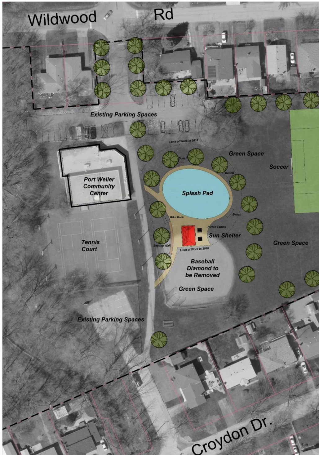
Port Weller Community Centre Splash Pad Concept Plan City of St. Catharines