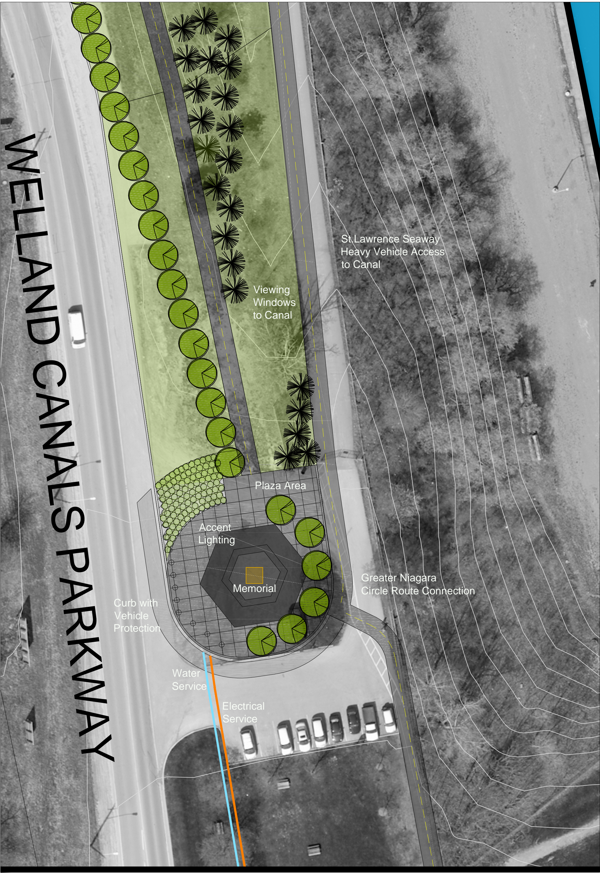
Welland Canal Workers Memorial : Lock III Welland Canal Generalized Site Layout Concept: For Budget Estimates Only